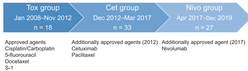
Fig. 1. Schematic diagram of the study.

The patients were divided into three groups: The patients who were treated with cytotoxic agents only from January 2008 to November 2012 were included in the Tox group, those treated with cytotoxic agents and cetuximab from December 2012 to March 2017 in the Cet group, and those treated with cytotoxic agents, cetuximab, and nivolumab from April 2017 to December 2019 in the Nivo group. Approved chemotherapeutic agents are listed below each periods.